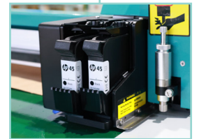
使用HP45墨盒 HP45 Ink Cartridge